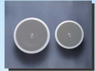
WS-801T WS-802T WS-100T WS-650T