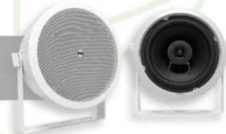
• WS - 652TR Dome Wall - Mounted Speaker