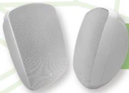
• AWS - 6502 Weatherproof hi - fi Speaker