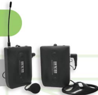
• WTS Series Wireless Interpretation System