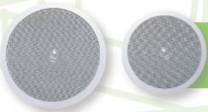
• WS - 650T / WS - 802T 6.5" / 8" Ceiling - Mounted Speaker