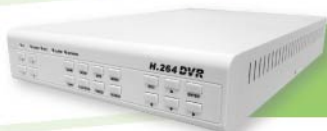
• L084 4CH 4 Ch Multiplexer